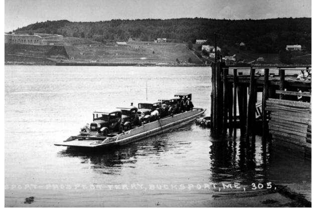
Buckspout Ferry