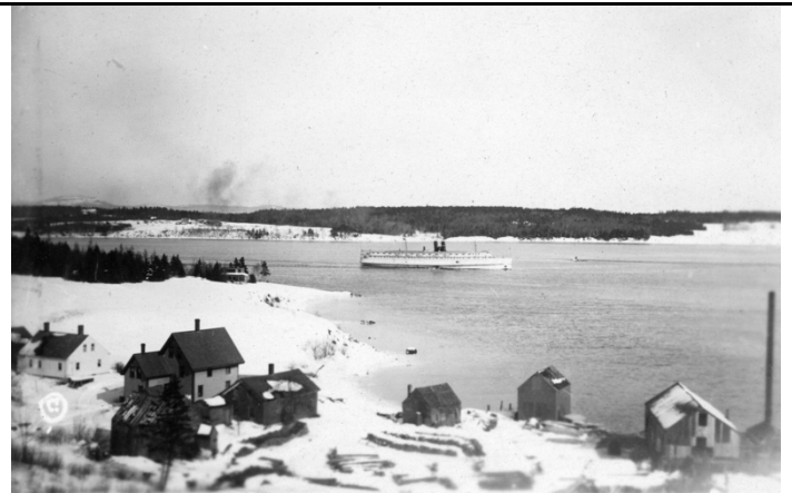
Steamer Belfast at Sandy Point